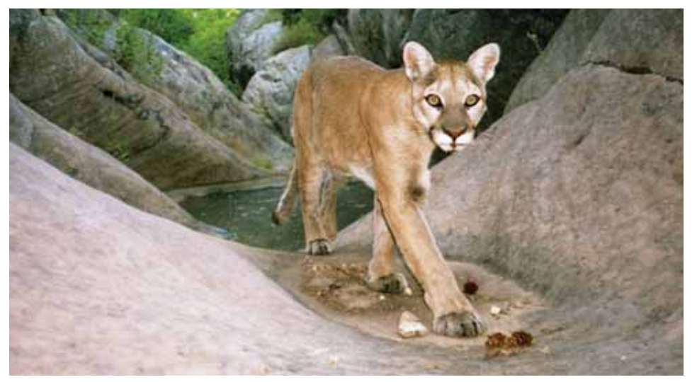
This young male mountain lion was photographed with an infrared-triggered remote camera.